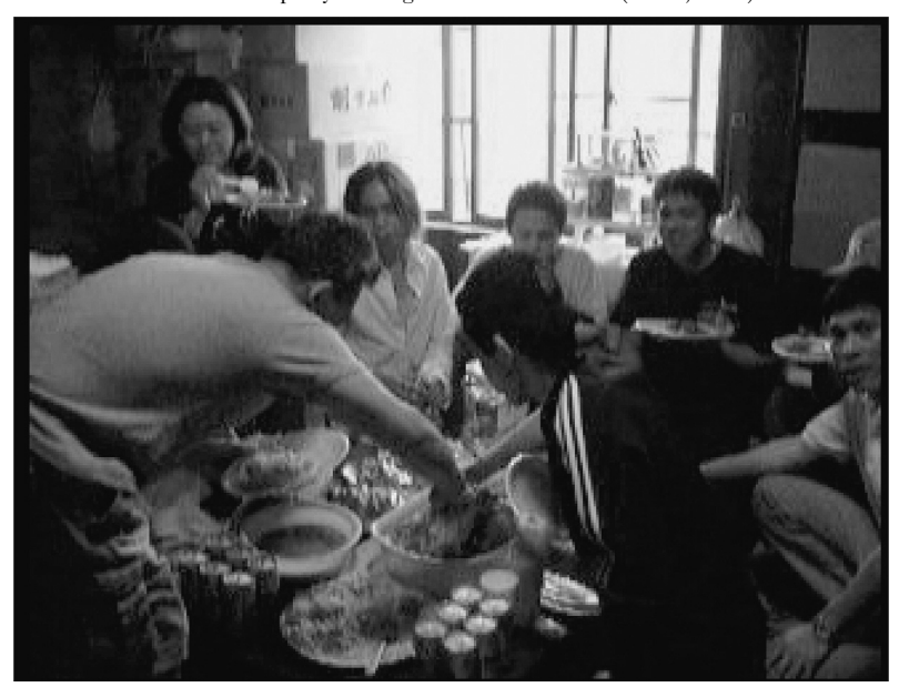
Picture 1: A kerukunan party serving Minahasan cuisine (Oarai, 2004).

sum of money is required when someone dies and the body must be sent home. One informant stated that there were at least six Minahasans who died in Oarai prior to 2004. Cooperative preparations for feasts and celebrations are also carried out on various occasions by each kerukunan (see Picture 1).