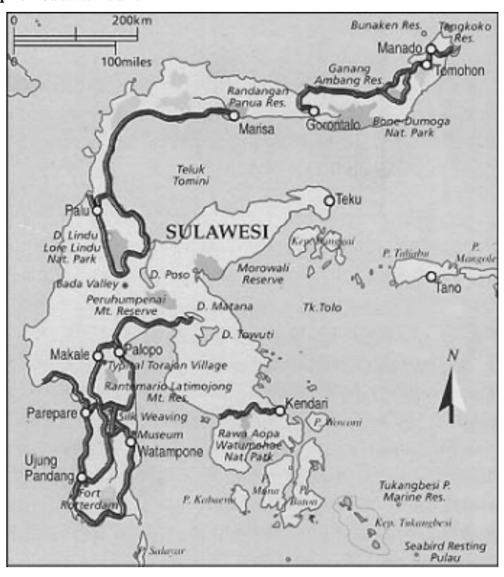
Map 2: Sulawesi Island

Dutch, and so were able to work, as local officials, scholars and even soldiers of the Dutch East Indies Army (KNIL). Thus, after Indonesian Independence, part of the Westernized Minahasan decided to flee to the Netherlands. Lundström-Burghoorn (1981: 28) still finds Dutch features in a Minahasan village of today: "In most villages the houses are situated on both sides of the streets. Each house is surrounded by a garden of flowers, spices and fruit trees, and white painted bamboo fences mark the house lot towards the streets — the Dutch influences are unmistakable."