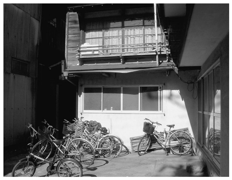
Picture 2: Minahasan workers' apartment building, leased under the name of their shachô (Oarai, 2004).

protection and loyalty are important bonds securing the irregular workers in Japan. A Minahasan family state that, without the help of their shachô , they would not have been able to stay in Japan for very long. The shachô always supports them in every aspect of life, and even becomes the guarantor in the purchase of a house, car, etc., whenever required (Picture 2) (see also Pudjiastuti 2005, in this journal).